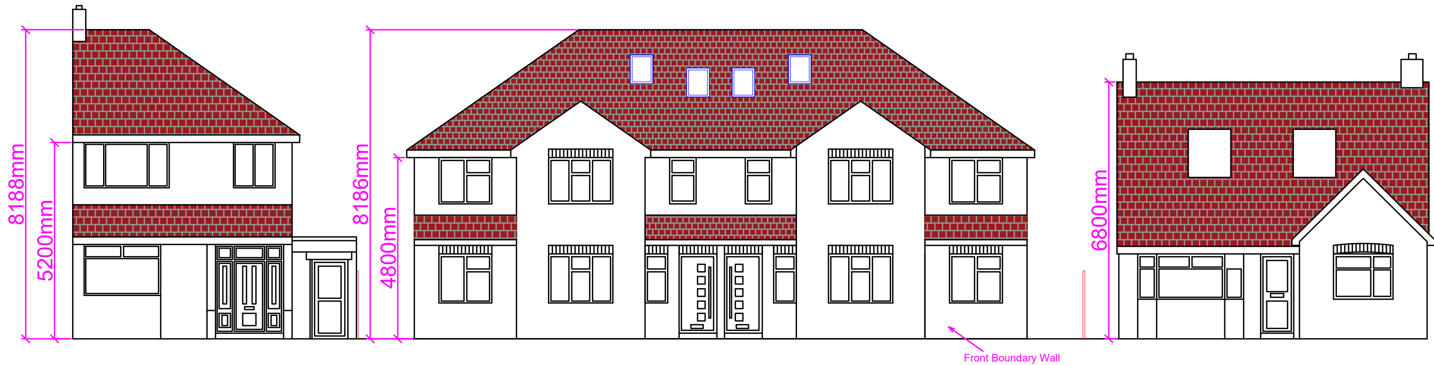
Existing Front Elevation of 76 Star Road

Note: The Drawings is for planning purpose and should not be used for construction. All dimensions should be confirmed on site and any deviation should be reported back to designer.