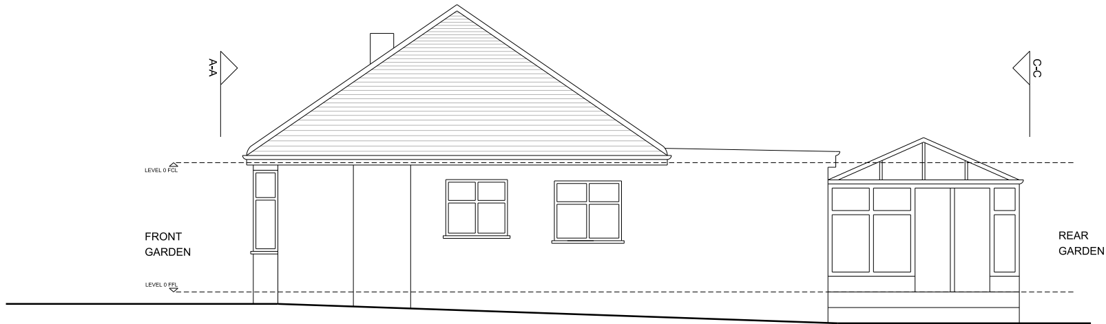
1. EXISTING SIDE ELEVATION D-D