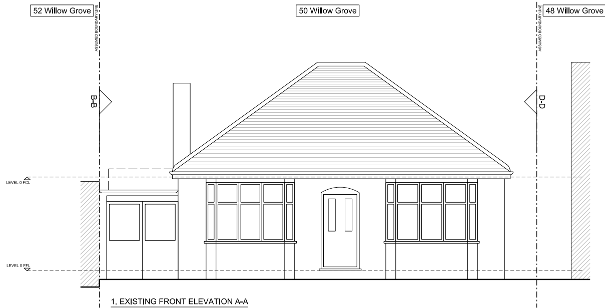
1. EXISTING FRONT ELEVATION A-A