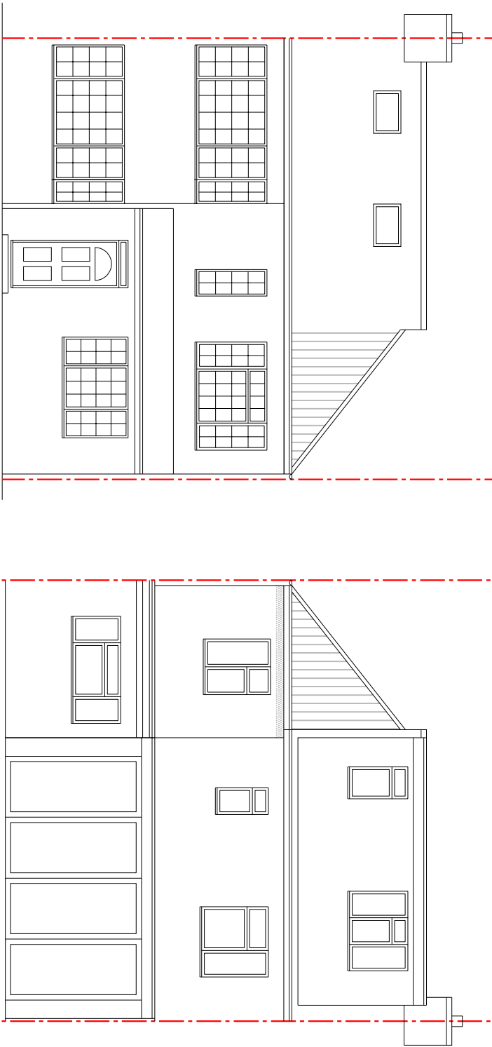
PROPOSED FRONT ELEVATION PROPOSED REAR ELEVATION

PROPOSED MATERIALS USED IN ANY EXTERIOR WORK WOULD BE OF A SIMILAR APPEARANCE TO THOSE USED IN THE CONSTRUCTION OF THE EXTERIOR OF THE EXISTING DWELLING HOUSE