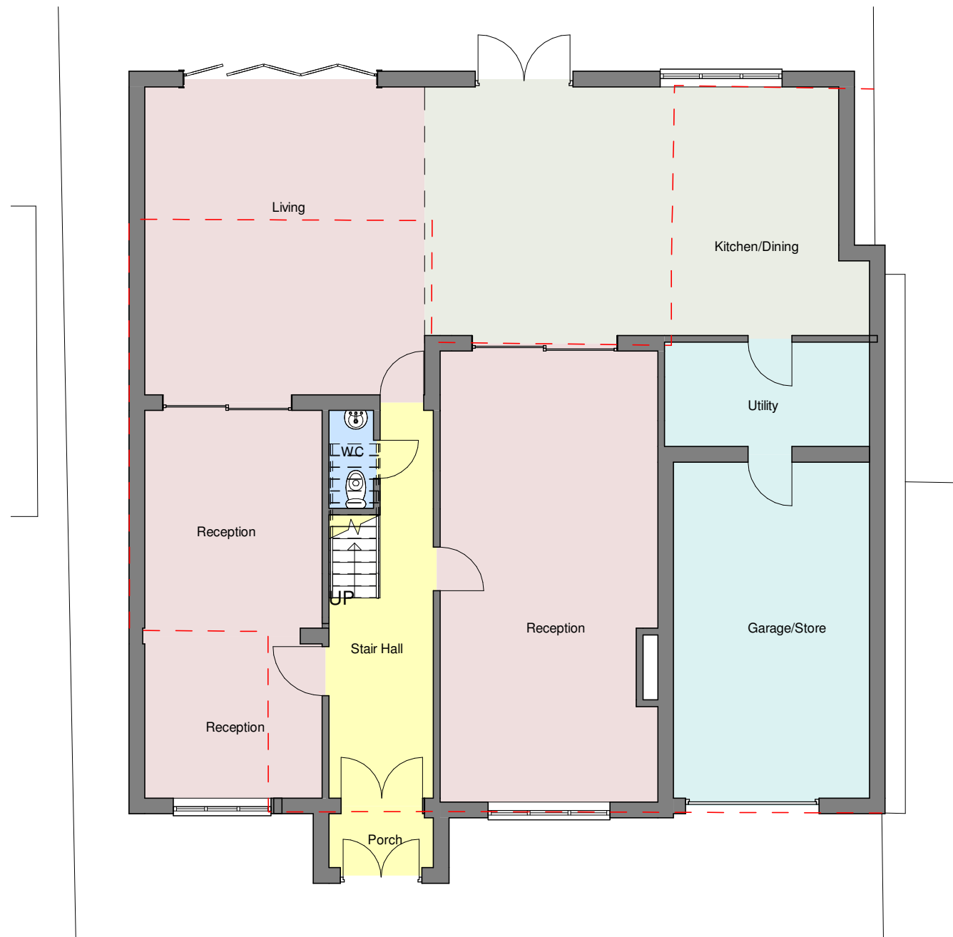
1 Proposed Ground Floor 2438-A-200 1 : 100