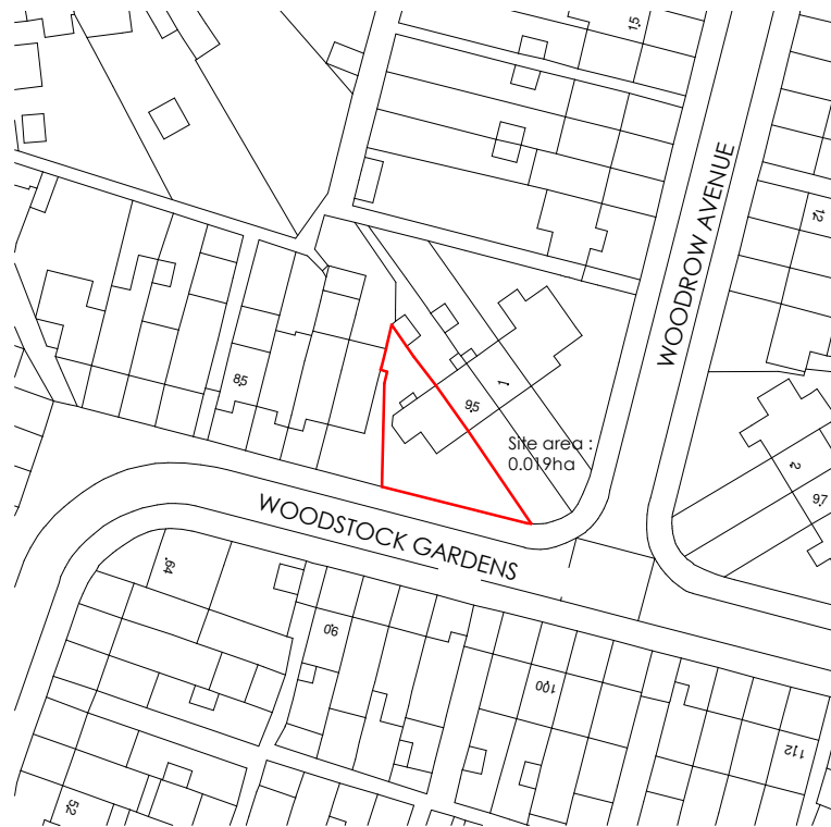
1 Location Plan 2403-L-001 1 : 1000