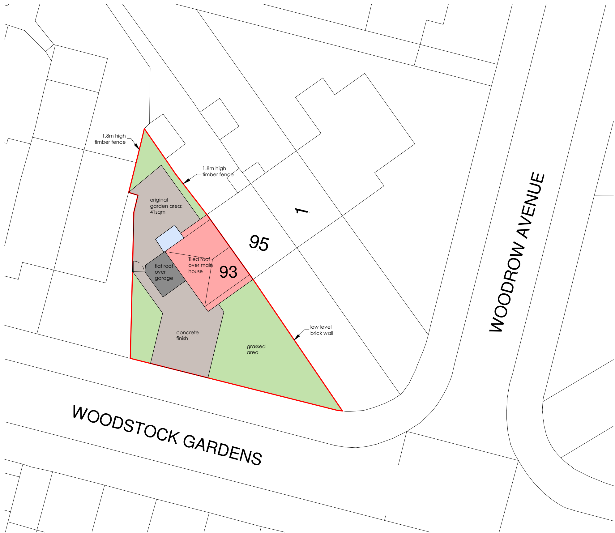
2 Existing Site Plan 2403-L-001 1 : 200