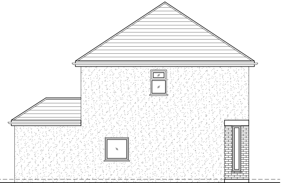
03-RIGHT SIDE ELEVATION