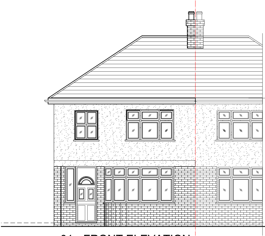
01 - FRONT ELEVATION