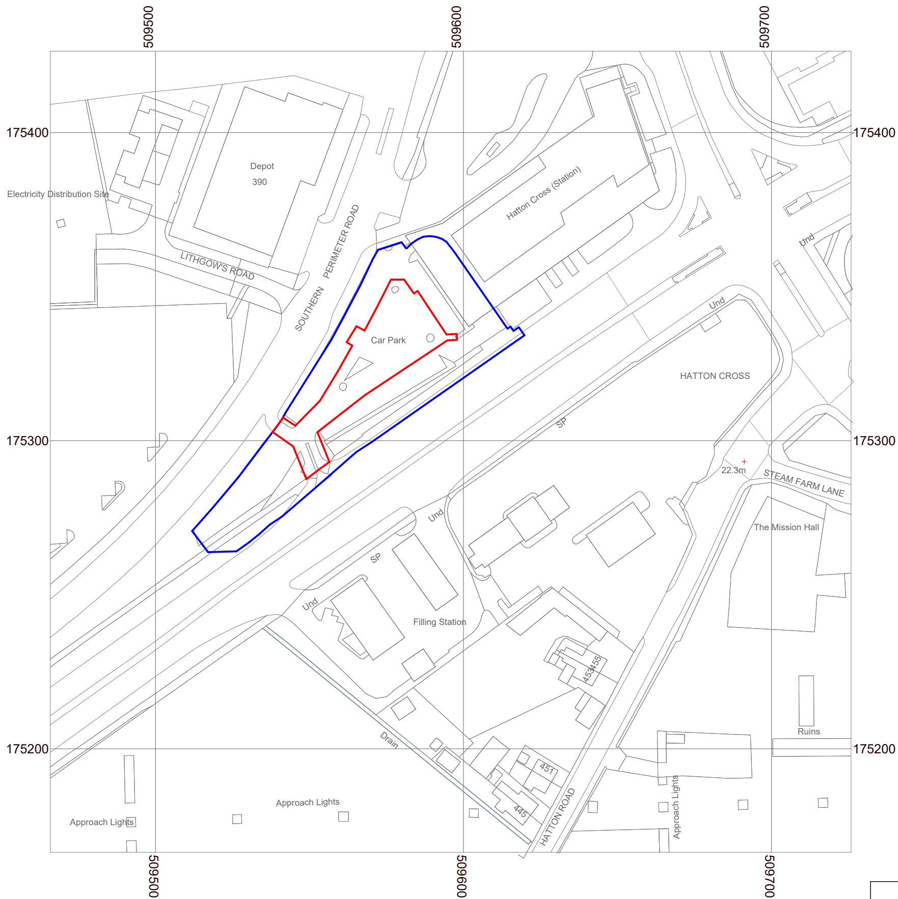
1 Location Plan 1 : 1250

Key: — Ownership boundary — Hatton Cross Charging Station boundary. Refer to Approved Planning Application 49133/APP/2025/168