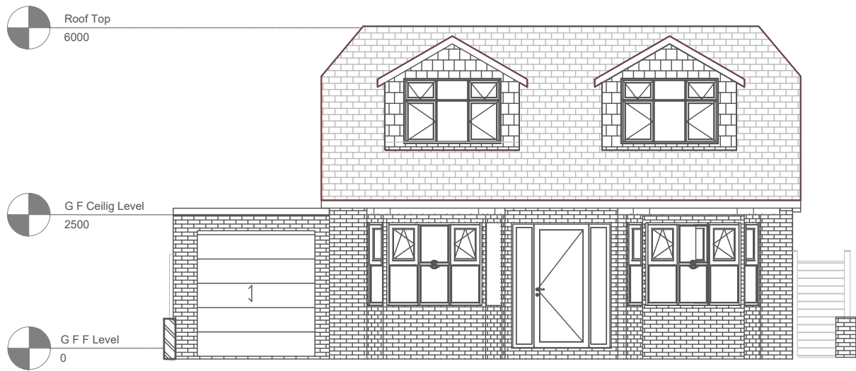
FRONT ELEVATION - PROPOSED