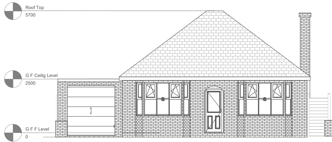
FRONT ELEVATION - EXISTING