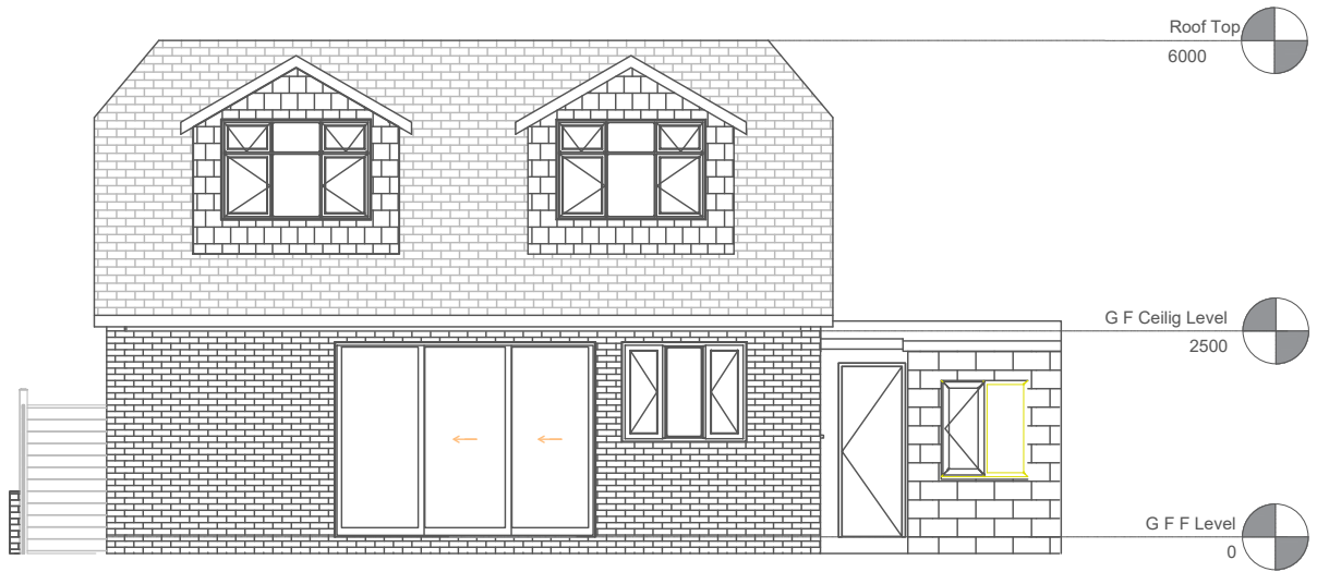
BACK ELEVATION - PROPOSED

NOTE: Copyright WVBS Ltd. This drawing is issued on the condition that it is not copied, reproduced or disclosed to any unauthorized person, wholly or in part, without the written consent of WVW. Do not scale from this drawing. All dimensions to be checked on site. This drawing must not be used for construction purposes unless accompanied by an instruction from the contract administrator. All dimensions to be verified and Rod drawings produced by manufacturer, for sign off by Client prior to manufacture. All discrepancies to be reported to WVBS Ltd immediately.