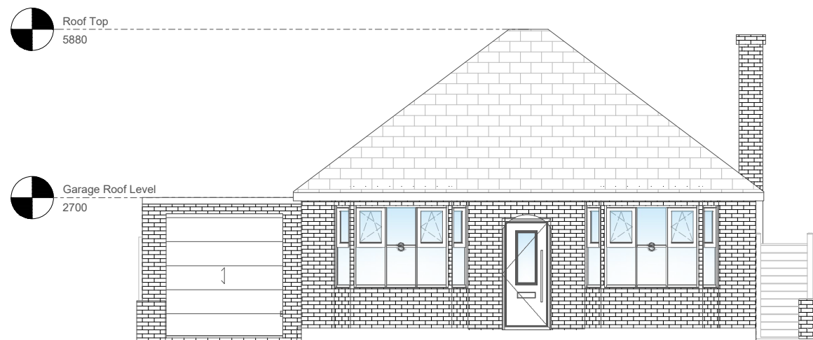
FRONT ELEVATION - EXISTING