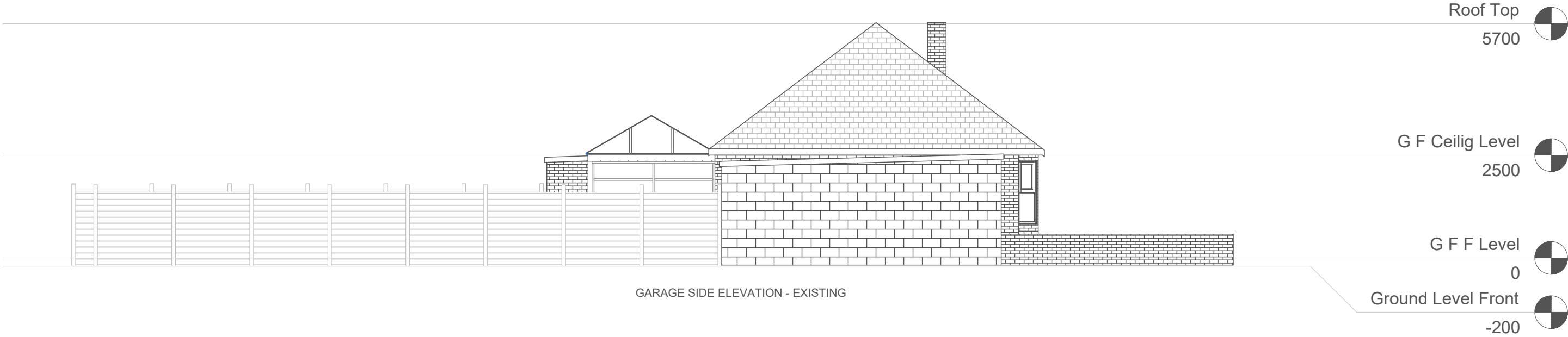
GARAGE SIDE ELEVATION - EXISTING