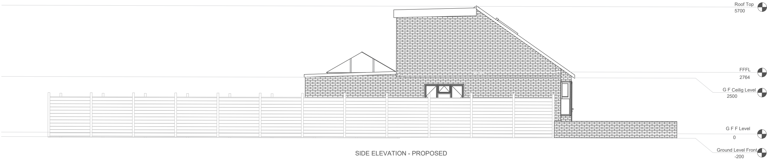
SIDE ELEVATION - PROPOSED