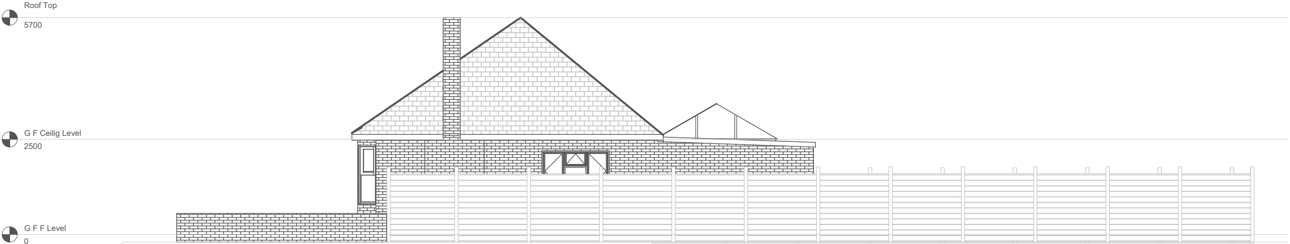
SIDE ELEVATION - EXISTING

NOTE: Copyright WVBS Ltd. This drawing is issued on the condition that it is not copied, reproduced or disclosed to any unauthorized person, wholly or in part, without the written consent of WVBS Ltd. Do not scale from this drawing. All dimensions to be checked on site. This drawing must not be used for construction purposes unless accompanied by an instruction from the contract administrator. All dimensions to be verified and Rod drawings produced by manufacturer, for sign off by WW or Client prior to manufacture. All discrepancies to be reported to WVBS Ltd immediately.