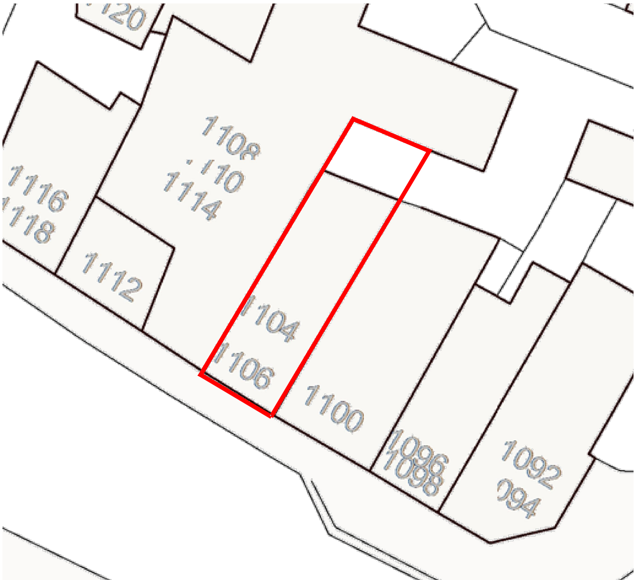
01 - OS MAP SCALE 1:1250