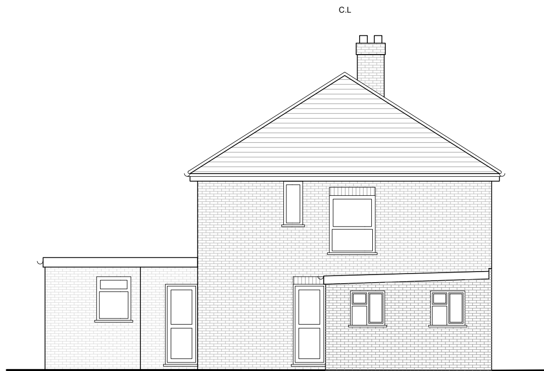
EXISTING SIDE (LHS) ELEVATION