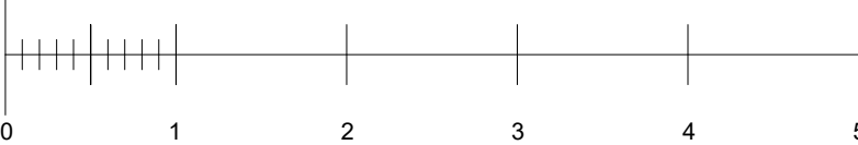
SCALE BAR IN METRES 1/50