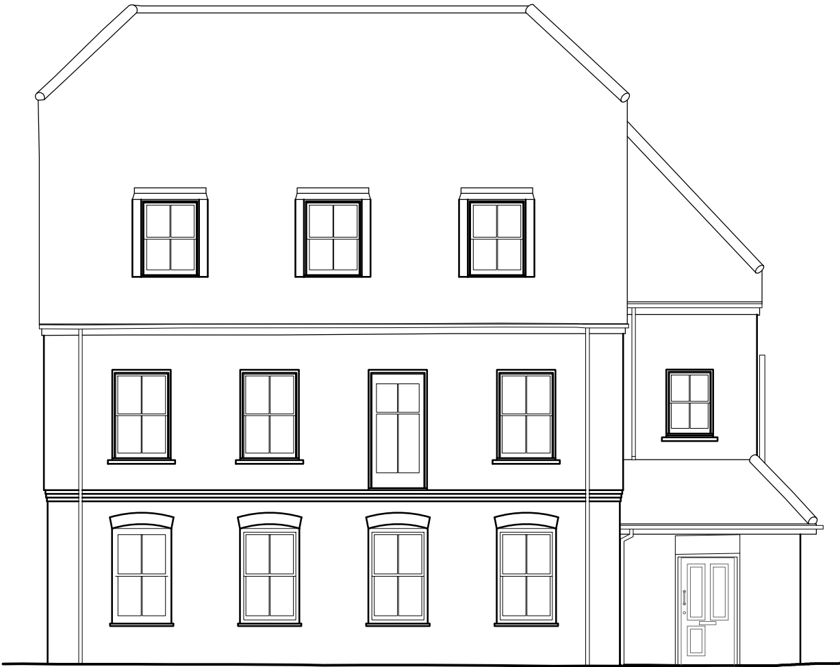
EXISTING NORTH EAST ELEVATION SCALE 1:100