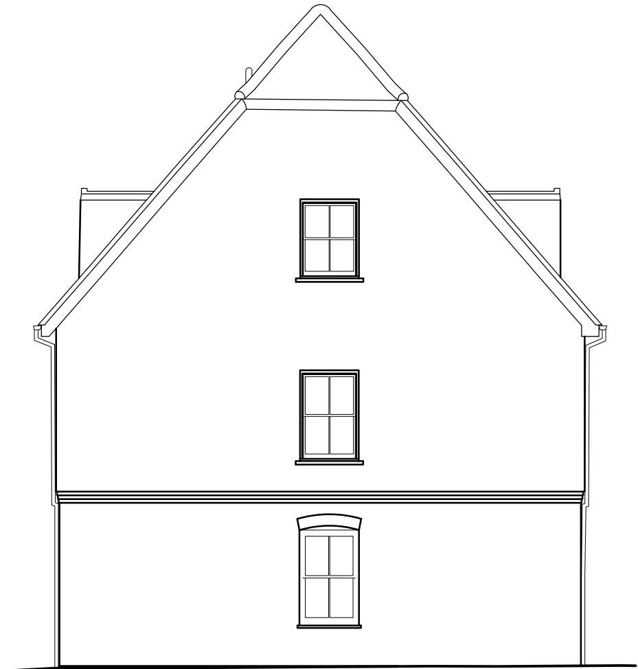
EXISTING NORTH WEST ELEVATION SCALE 1:100