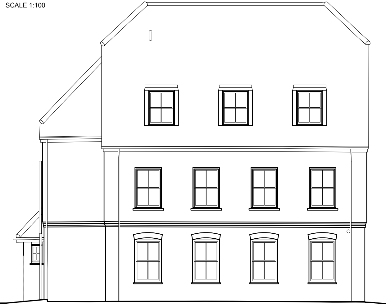
EXISTING SOUTH WEST ELEVATION SCALE 1:100