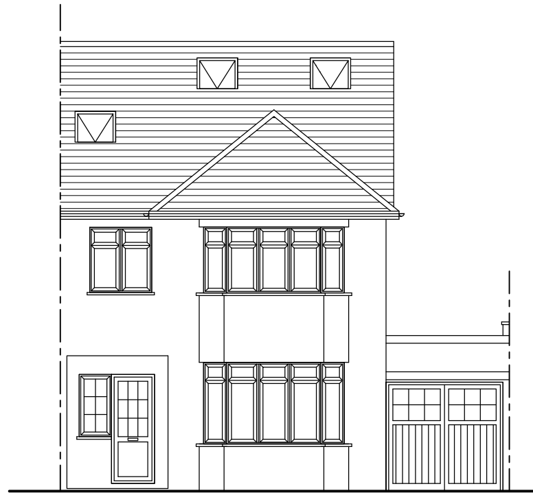
EXISTING FRONT ELEVATION (UNALTERED)

All materials to match existing roof and wall materials in type & colour