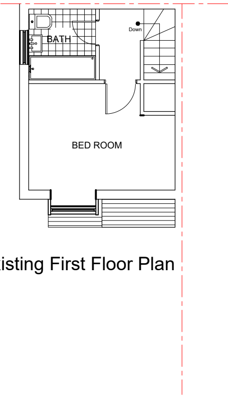
Existing First Floor Plan

NOTES 1. ALL THE DIMENSIONS TO BE CHECKED AT SITE AS WORK COMMENCES. 2. ANY DISCREPANCIES OR OMISSIONS FOUND IN THE DRAWINGS SHALL BE REPORTED TO THE ARCHITECT IMMEDIATELY. 3. FOLLOW WRITTEN DIMENSIONS ONLY AND DO NOT SCALE THE DRAWING. 4. ALL THE DIMENSIONS ARE IN MM UNLESS NOTED OTHERWISE. 5. THIS PROPOSAL MUST NOT BE USED FOR ANY OTHER PURPOSE OTHER THAN STATED BELOW. 6. NO WORK TO BE CARRIED OUT PRIOR TO THE APPROVAL OF THE DRAWINGS UNDER THE TOWN PLANNING AND COUNTRY PLANNING ACTS AND THE BUILDING REGULATIONS. 7. ALL DIMENSIONS, LEVELS AND DETAIL OF EXISTING STRUCTURE INDICATED ON THE DRAWING TO BE CHECKED ON SITE BY THE MAIN CONTRACTOR BEFORE COMMENCING THE WORK AND ANY VARIANCE NOTED TO BE REPORTED TO PROPORTIONS DESIGN STUDIO LTD. 8. MAIN CONTRACTOR TO BE RESPONSIBLE FOR NOTIFYING THE LOCAL AUTHORITY OF THE START OF THE WORK AND FOR ARRANGING REQUIRED STAGE INSPECTIONS TO BE CARRIED OUT. CLIENT TO BE ADVISED OF ANY ADDITIONAL WORKS REQUESTED BY THE BUILDING INSPECTOR. 9. ALL DIMENSIONS READ IN CONJUNCTION WITH ALL THE STRUCTURE ENGINEER'S DRAWINGS AND CALCULATIONS.