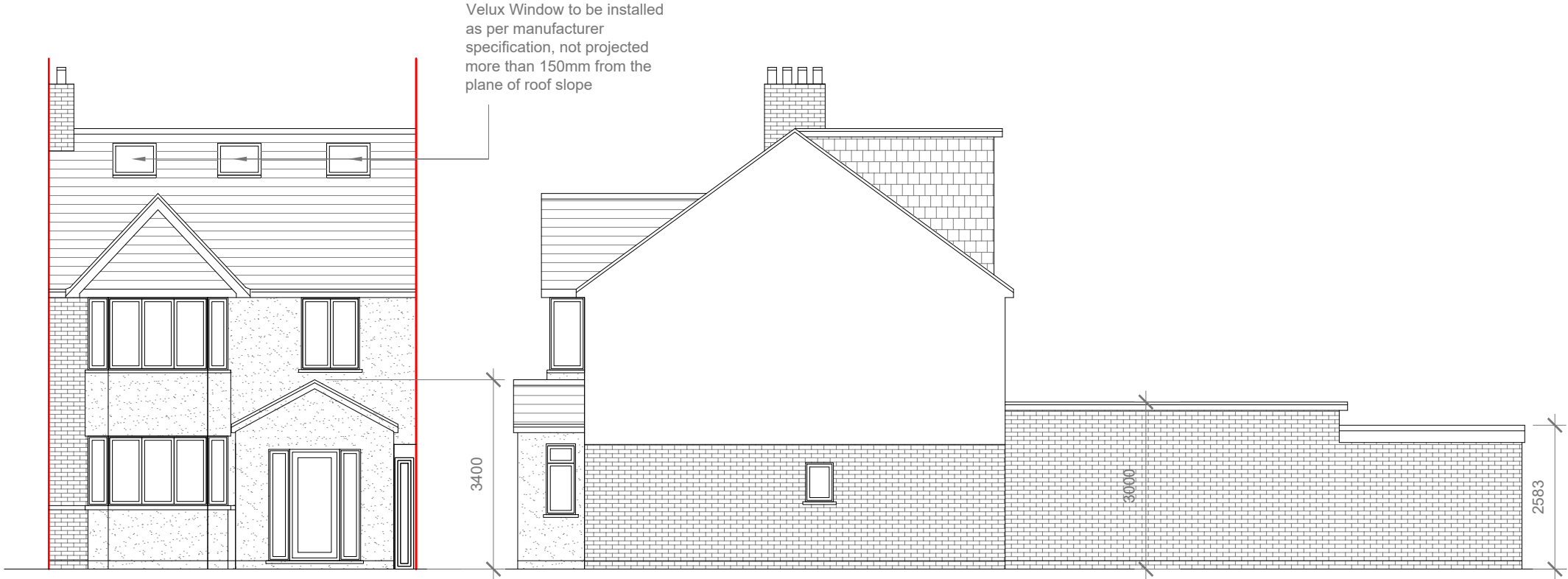
Existing Front Elevation Scale 1:100

Proposed External Finish Materials to Match Existing External Finish Materials Proposed Flank Wall Window to be Obscure Glazed and Non Opening below 1.7m from FFL