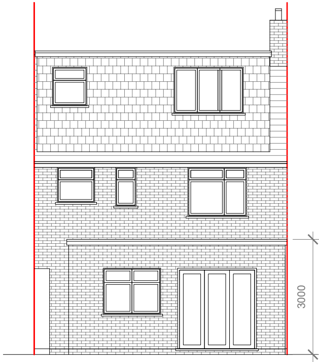
Approved Rear Elevation Scale 1:100