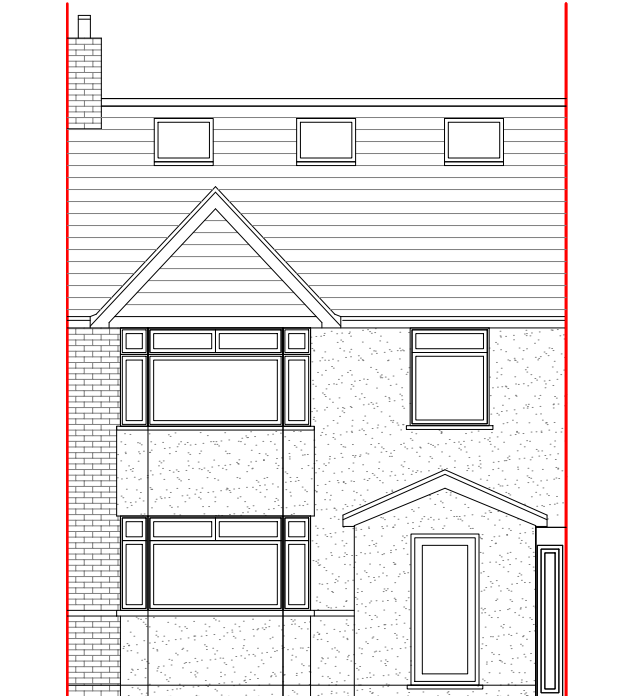
Approved Front Elevation Scale 1:100

Proposed External Finish Materials to Match Existing External Finish Materials