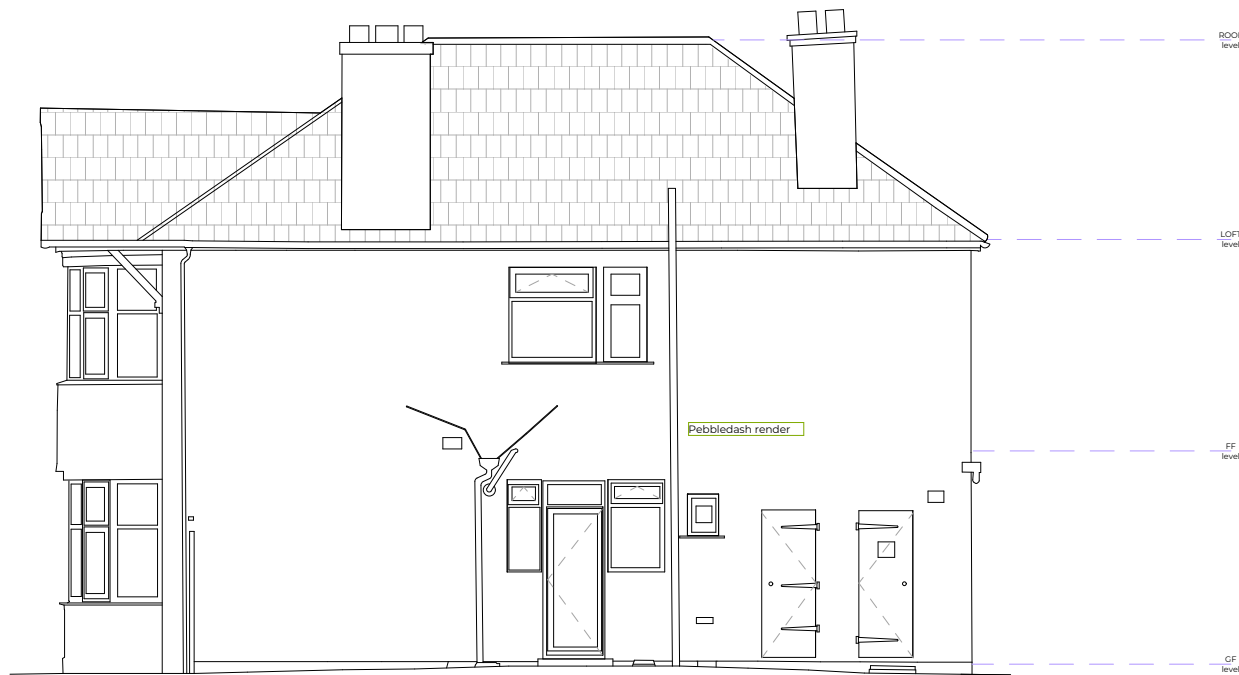
EXISTING SIDE ELEVATION (FOOTPATH SIDE)