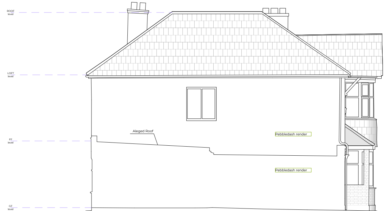
EXISTING SIDE ELEVATION (GARAGE SIDE)