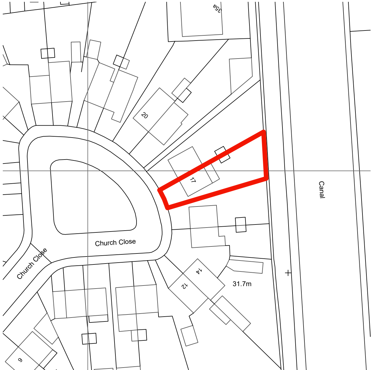
LOCATION BLOCK PLAN 1:1250@A4