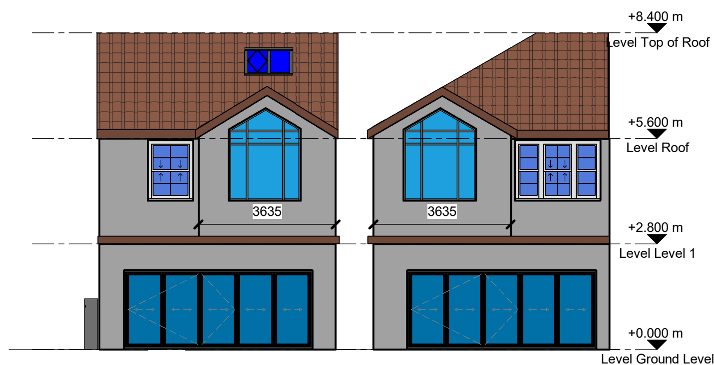
7 Rear Elevation of Proposed Dwelling 1 : 100