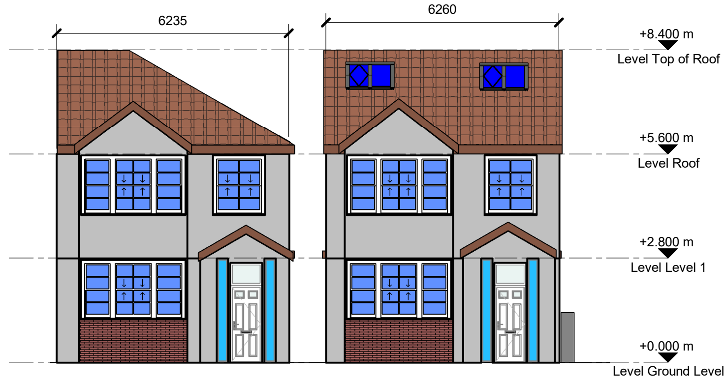
5 Front Elevation of Proposed Dwelling 1 : 100