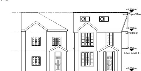
5 Front Elevation of Proposed Dwelling