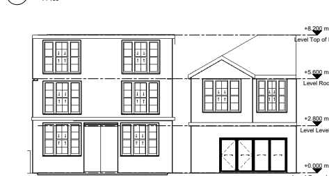
7 Rear Elevation of Proposed Dwelling