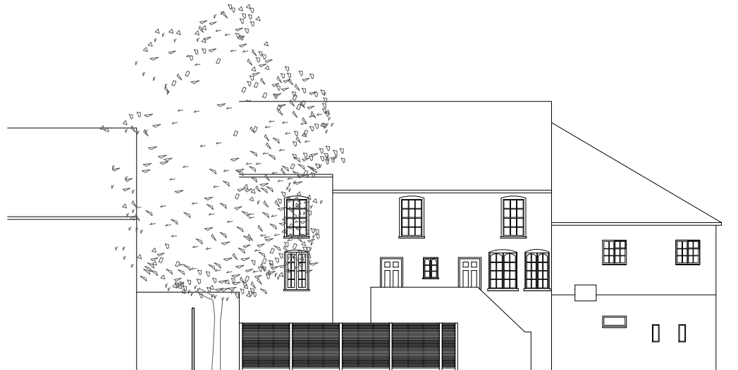
Proposed Rear (West) Elevation 1:200