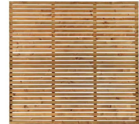
Harmony Cedar Look Fence Panel