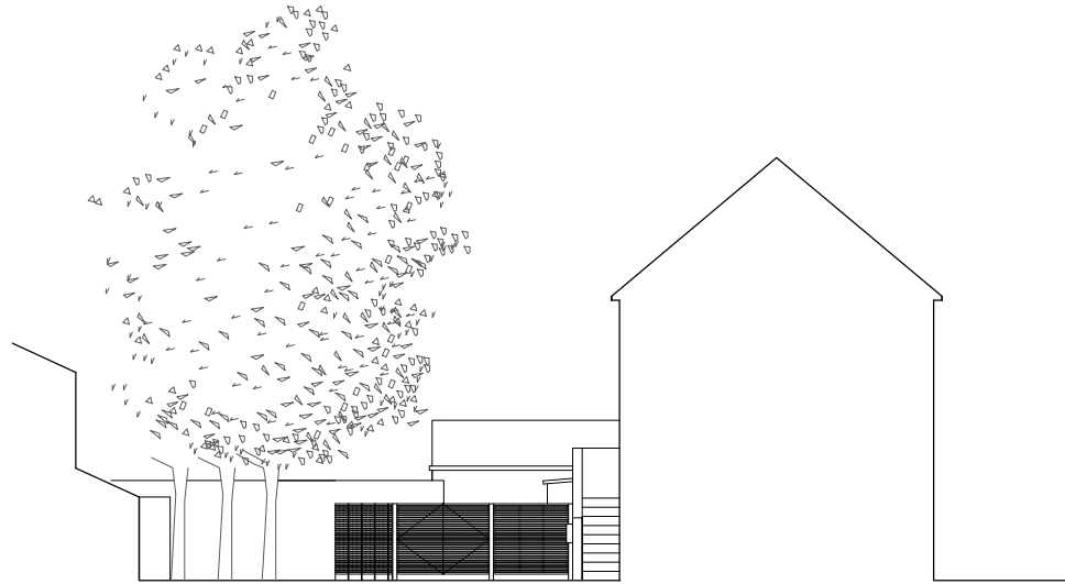
Proposed Section/Elevation Facing North 1:200