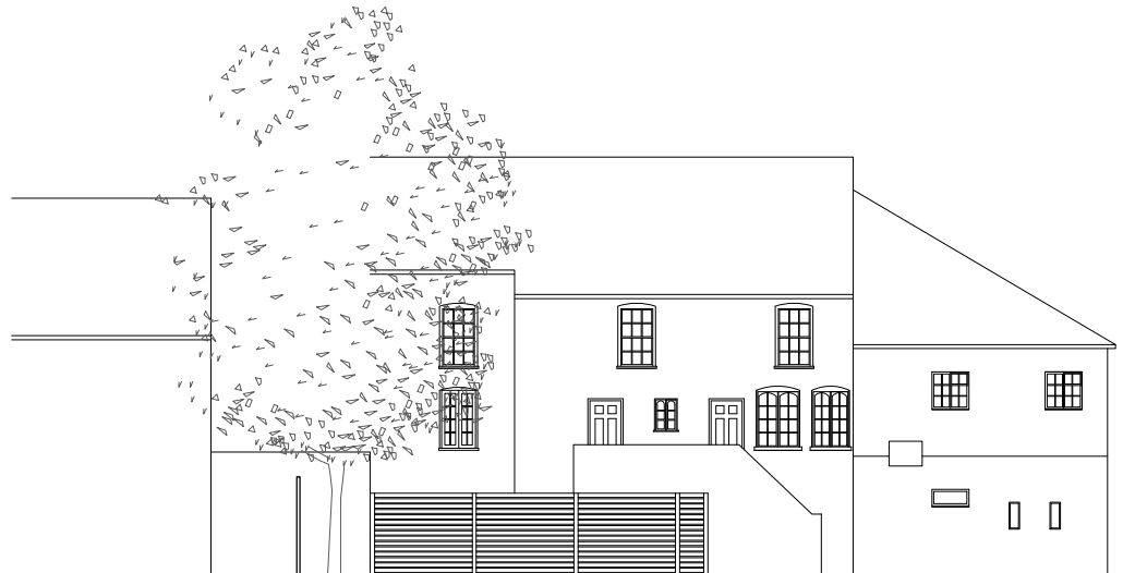
Proposed Rear (West) Elevation 1:200