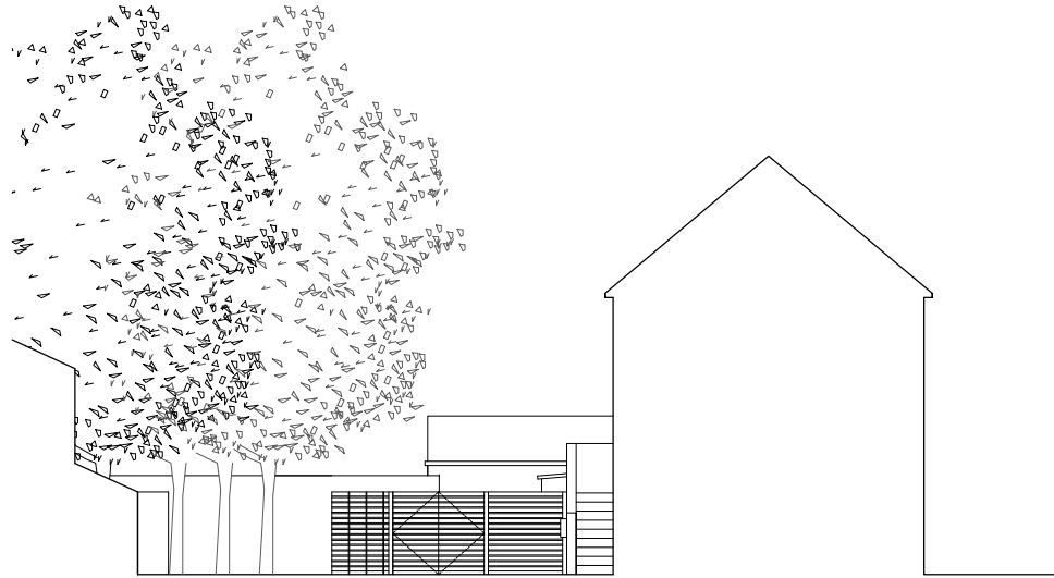
Proposed Section/Elevation Facing North 1:200