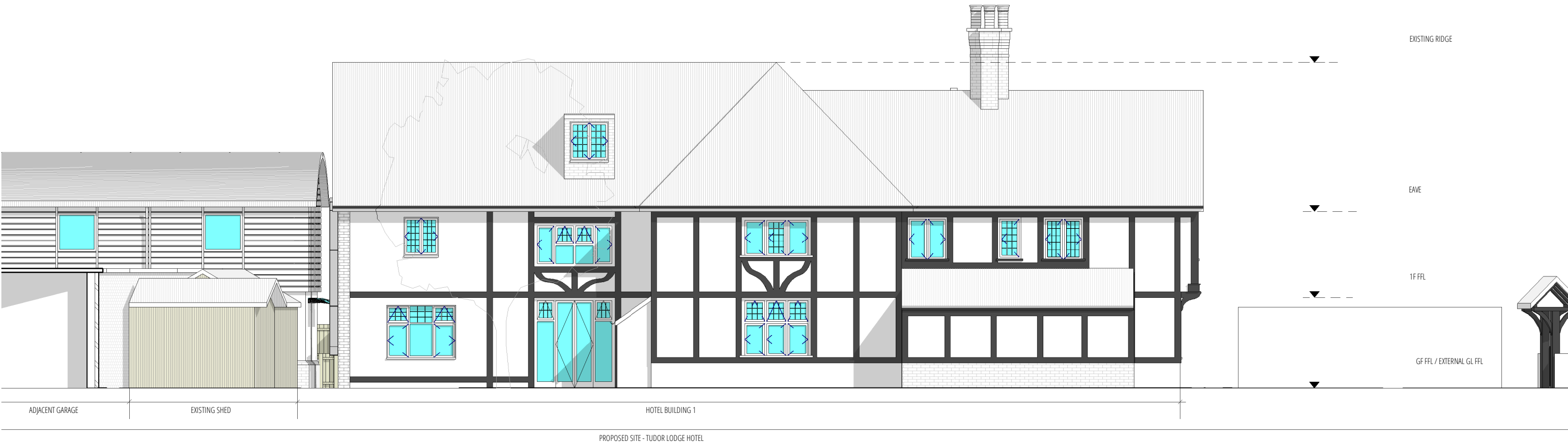
01 EXISTING FRONT ELEVATION 1:100 @ A3