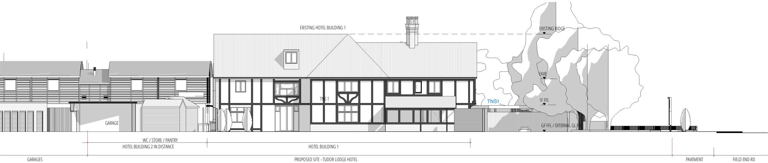
01 PROPOSED SOUTH ELEVATION 1:200 @ A3