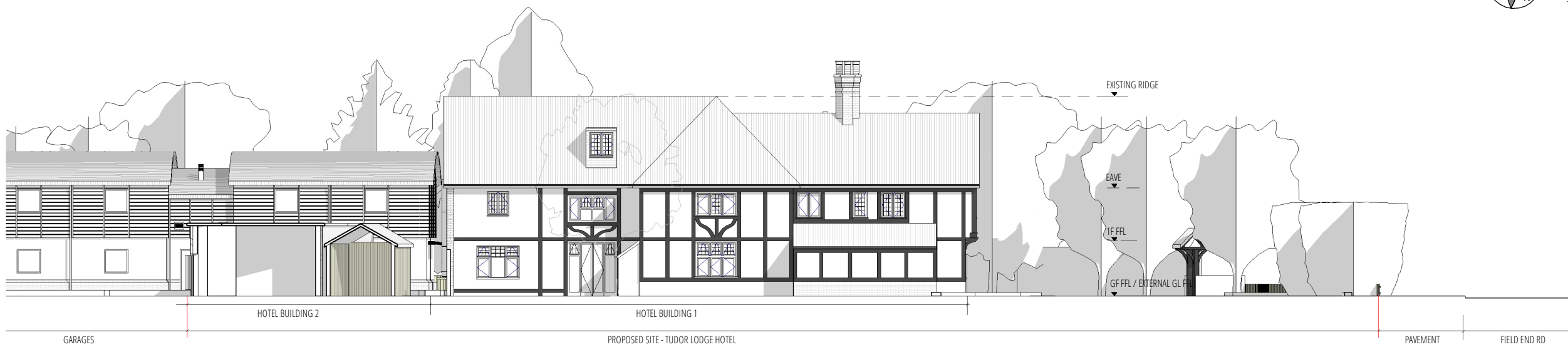
01 EXISTING SOUTH ELEVATION 1:200 @ A3