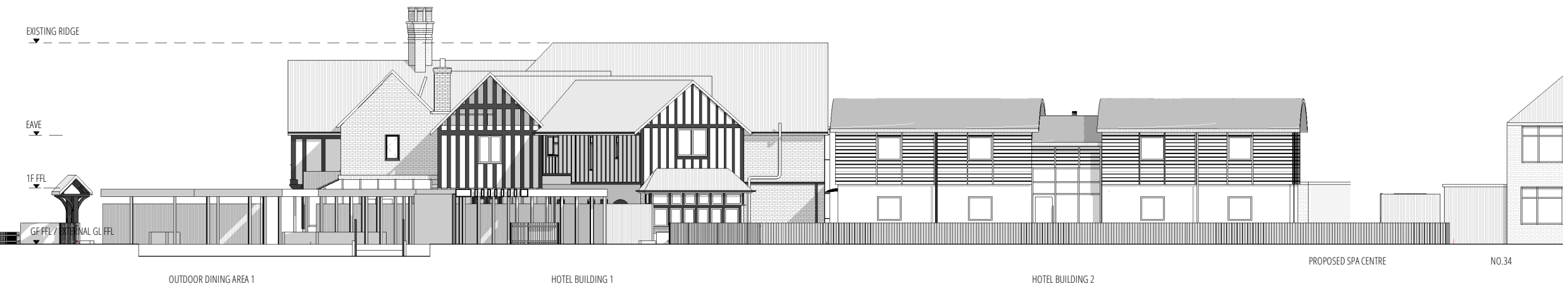
01 PROPOSED REAR / NORTH ELEVATION 1:200 @ A3