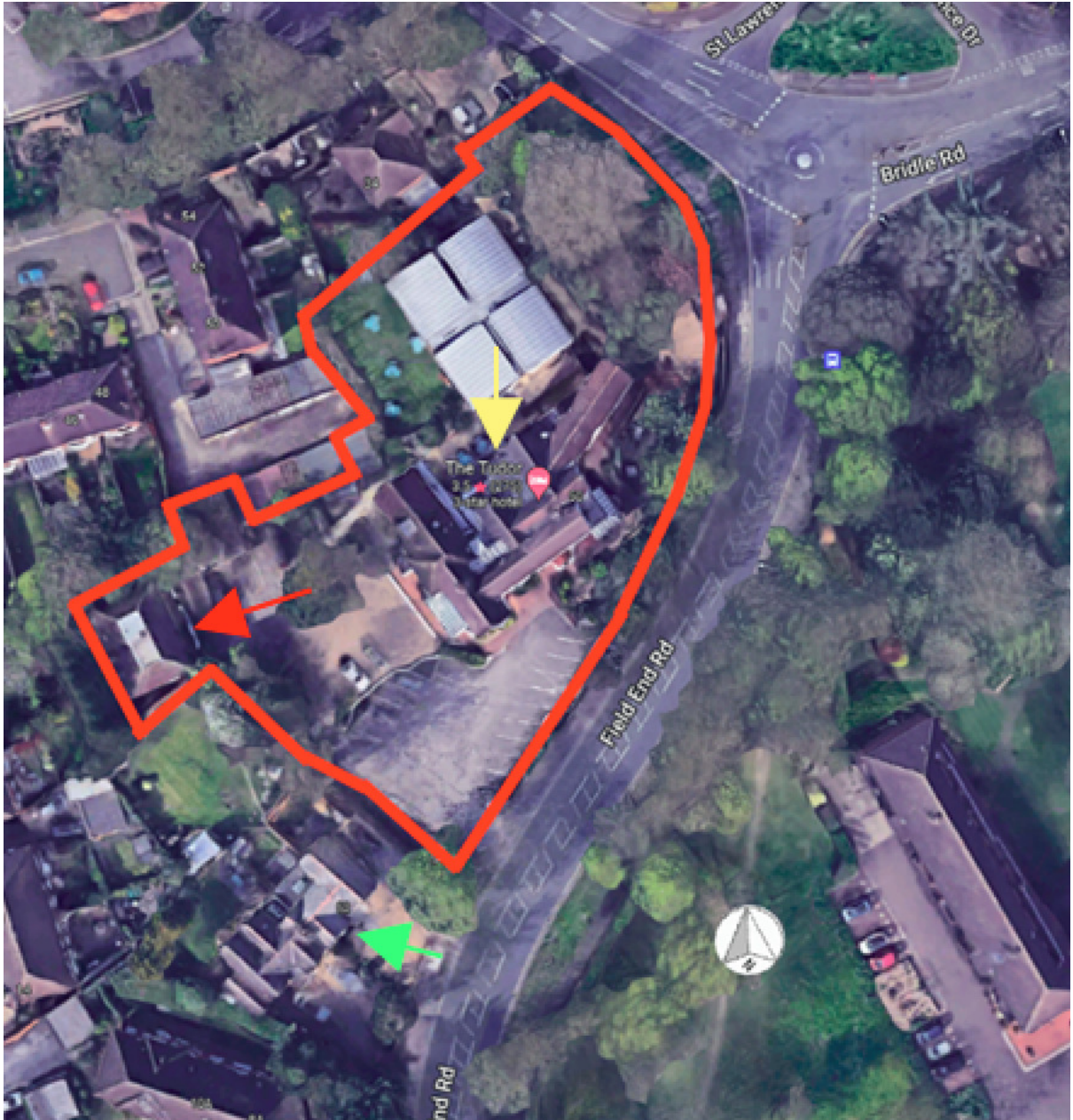
Fig 1: Aerial site plan (Yellow - Grade II listed building 1 / Red – Hotel building 3 with proposed double storey side extension, / Green – 52a Field End rd)