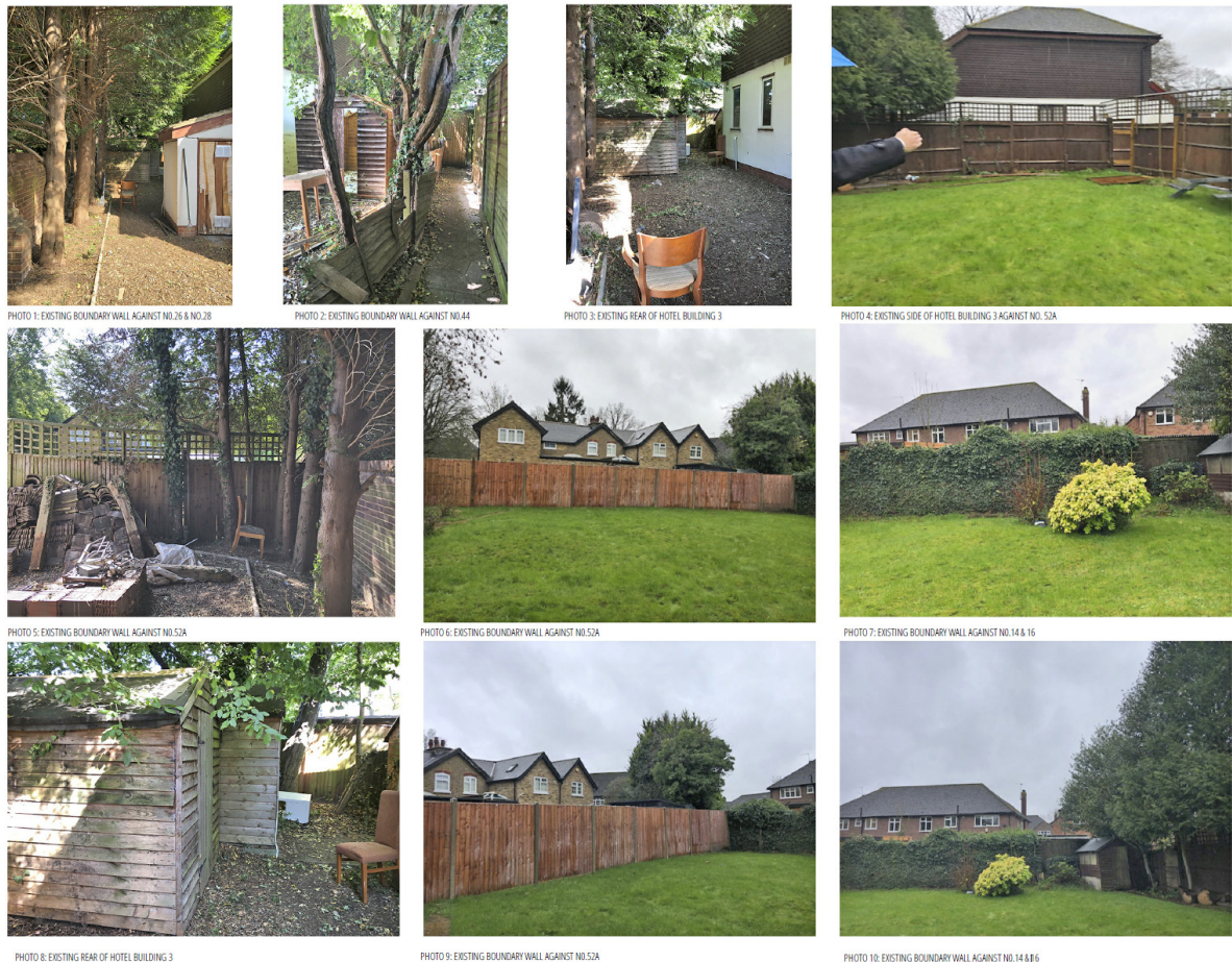
Fig 2: existing photos