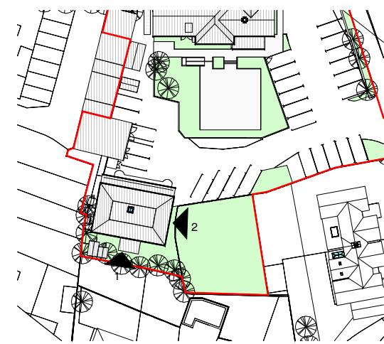
03 KEY PLAN 1:500 @ A3