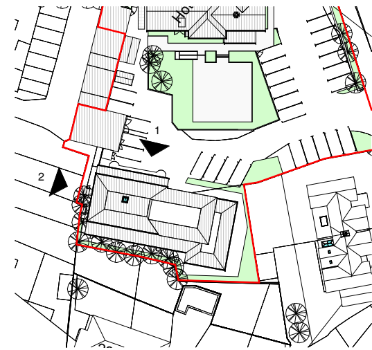
03 KEY PLAN 1:500 @ A3

0 1 1:100@A3 5M J79 STUDIO T: +44 (0)7742 071 052 W: info@j79studio.co.uk Unit 312 Wey House 15 Church Street Weybridge KT13 8NA