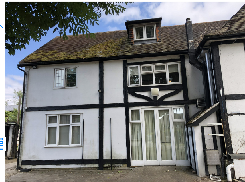
03 EXISTING TUDOR SUITE WINDOW PHOTO 1:10 @ A3