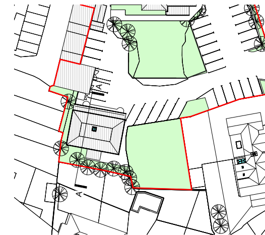
03 KEY PLAN 1:500 @ A3