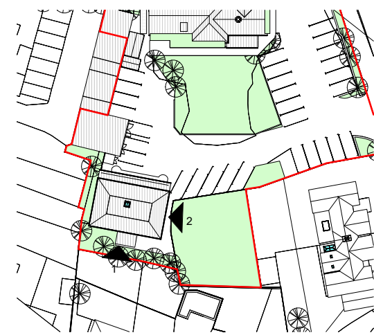
03 KEY PLAN 1:500 @ A3