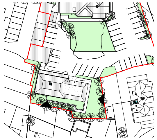
03 KEY PLAN 1:500 @ A3