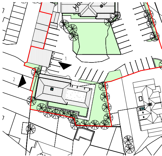
03 KEY PLAN 1:500 @ A3

J79 STUDIO T: +44 (0)7742 071 052 W: info@j79studio.co.uk Unit 312 Wey House 15 Church Street Weybridge KT13 8NA