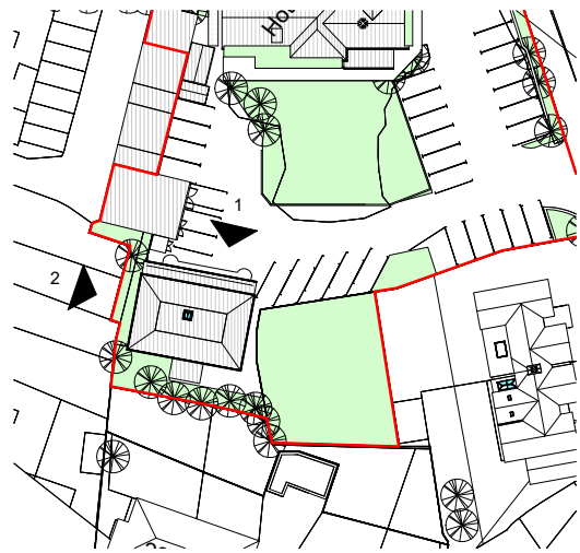
03 KEY PLAN 1:500 @ A3

J79 STUDIO T: +44 (0)7742 071 052 W: info@j79studio.co.uk Unit 312 Wey House 15 Church Street Weybridge KT13 8NA