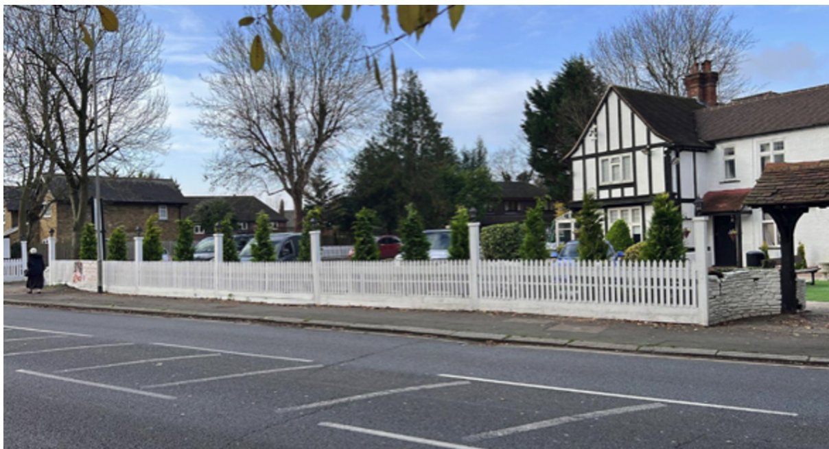
Fig 8: Newly installed boundary fence on Field End Rd with planting matching existing style