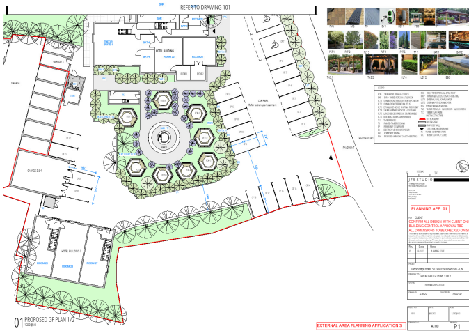
Table 3.1 Proposed Parking Provision