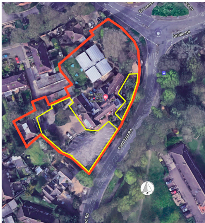
Fig 1: Aerial site plan (Yellow arrow – external area with proposed structure)