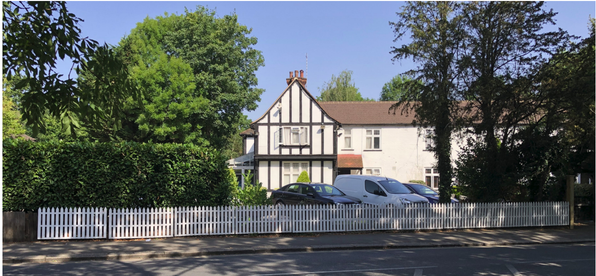
Fig 9: Newly installed boundary fence on Field End Rd, matching existing style