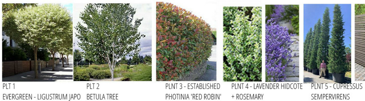
Fig 10: proposed planting around hotel ground and external sitting area.