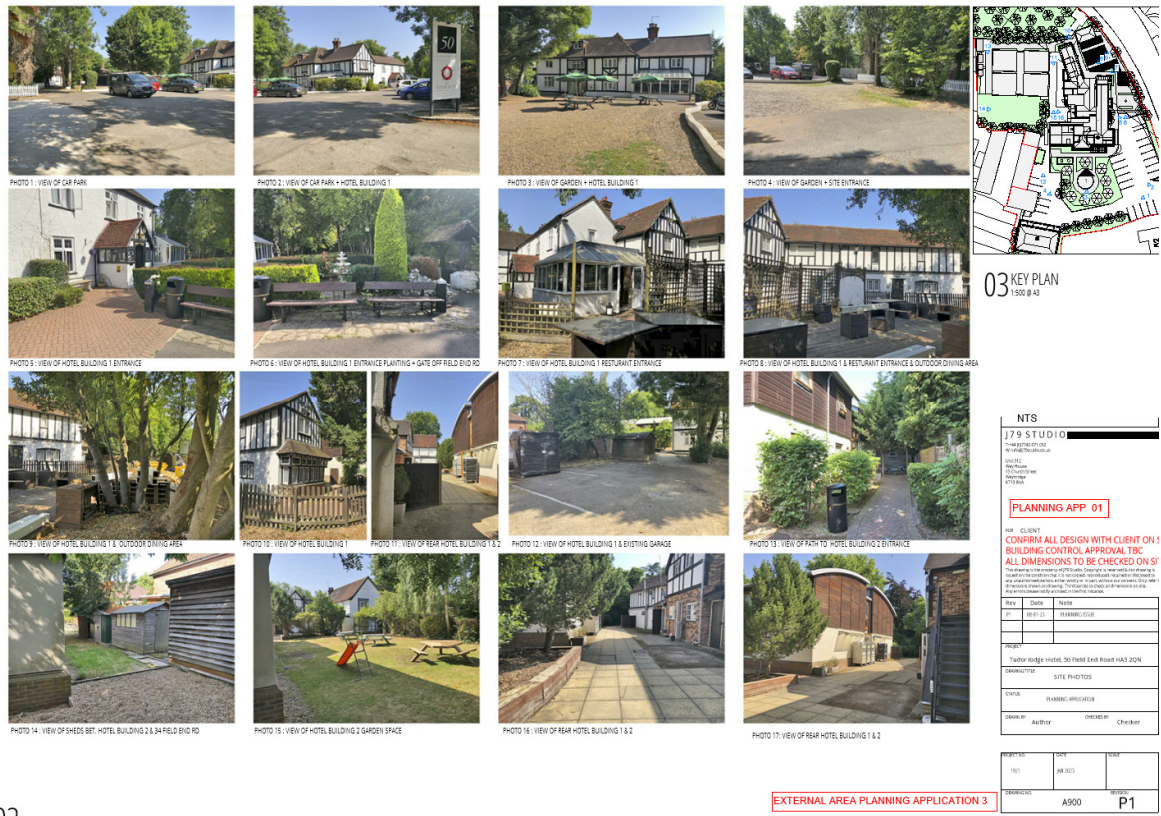
Fig 2: existing photos of external area

The Tudor lodge hotel consisted of several buildings with Hotel building 1 being a Grade II listed buildings and building 2 with modern design. The site is located at the junction of Field End Rd and Bridle Rd.