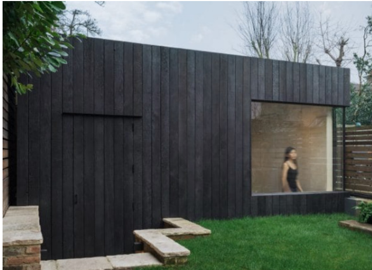
Fig 7: Proposed dark grey timber clad outdoor food prep hut & WC / store hut

The design approach applied here is to utilise existing outdoor space to create vibrancy to existing space. The proposed igloo structure aims to tie in with existing listed hotel building whilst sensitive to its surrounding. Various mature planting is aimed to create privacy whilst enhance the existing hotel ground.