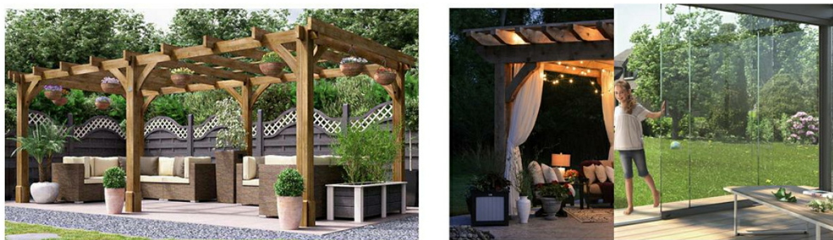
TNS 1- TRADITIONAL TIMBER PERGOLA WITH GLASS ROOF