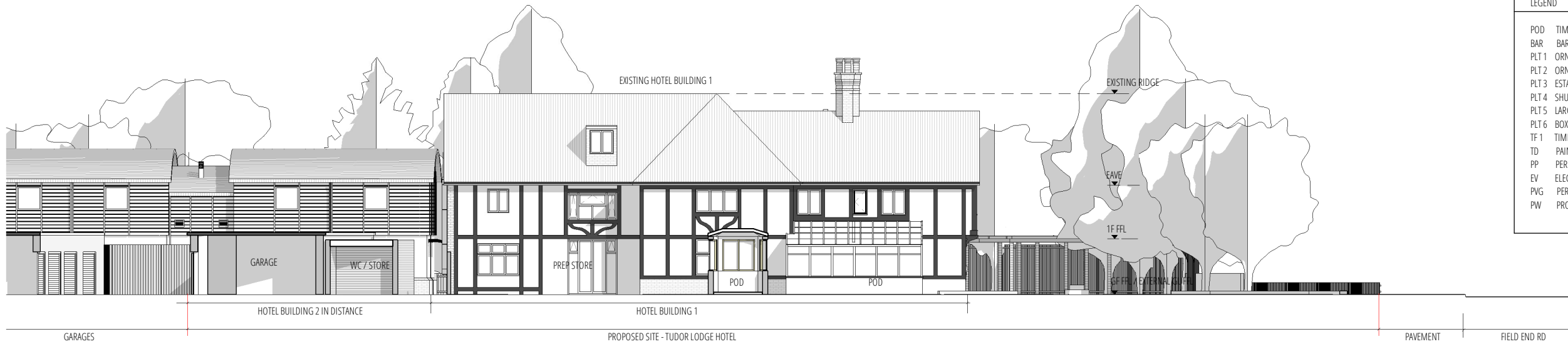
01 PROPOSED FRONT S/W ELEVATION 1:200 @ A3