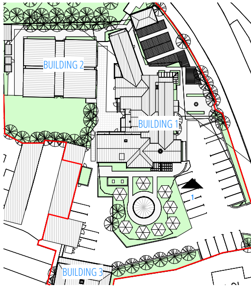
03 KEY PLAN 1:500 @ A3