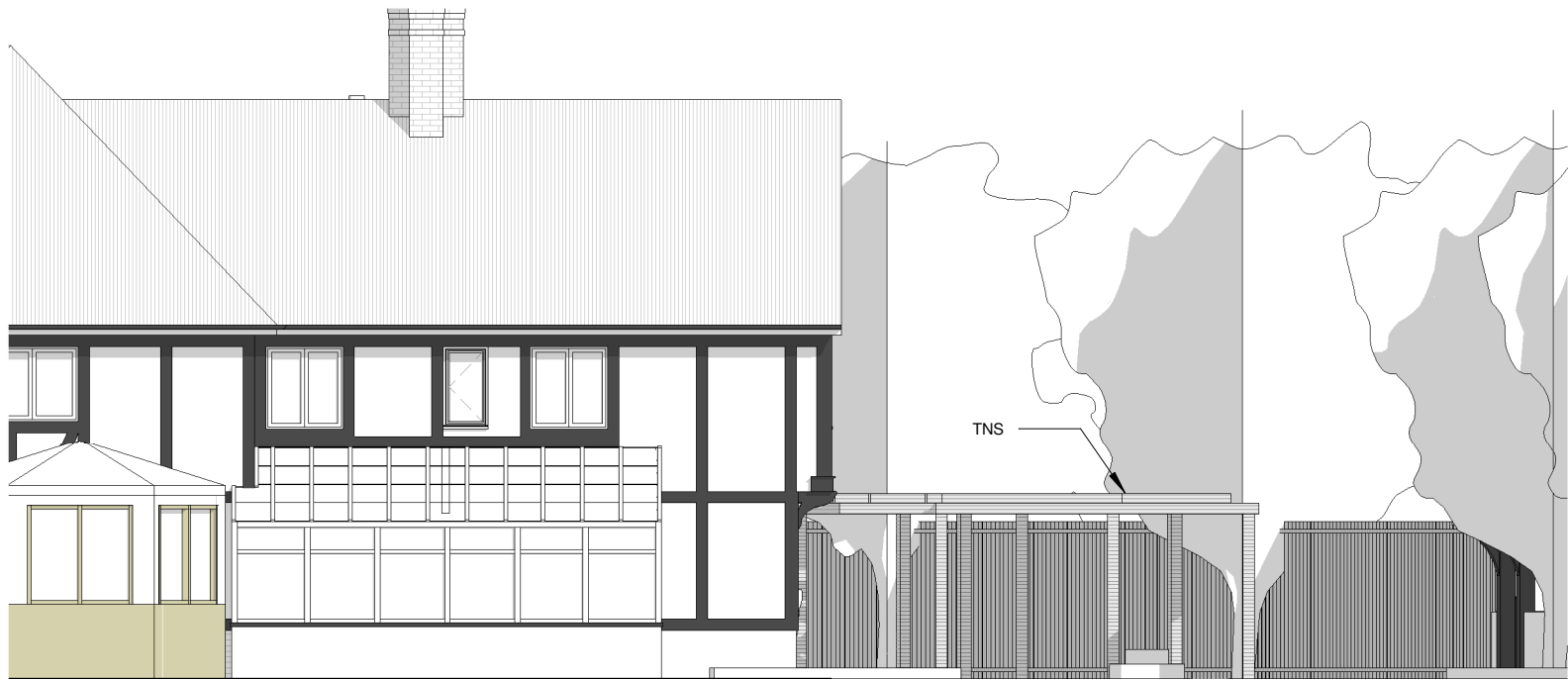
02 PROPOSED FRONT S/W ELEVATION 1:100 @ A3