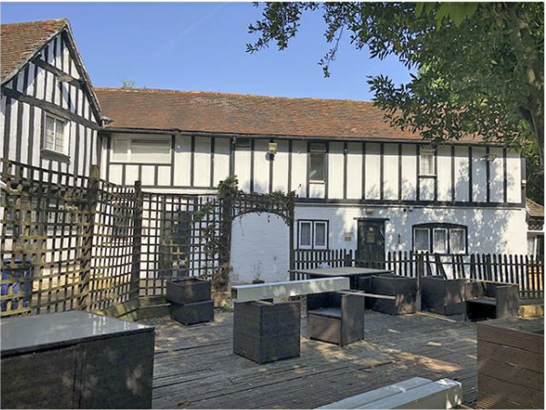
PHOTO 8 : VIEW OF HOTEL BUILDING 1 & RESTURANT ENTRANCE & OUTDOOR DINING AREA