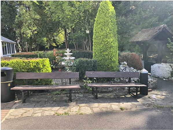
PHOTO 6 : VIEW OF HOTEL BUILDING 1 ENTRANCE PLANTING + GATE OFF FIELD END RD