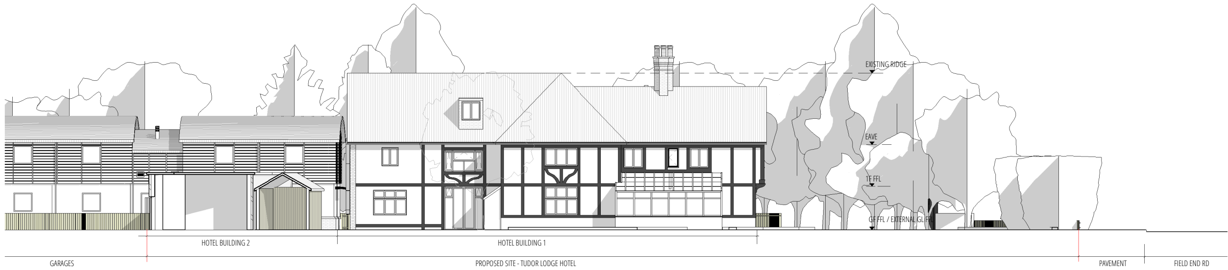
01 EXISTING FRONT S/W ELEVATION 1:200 @ A3