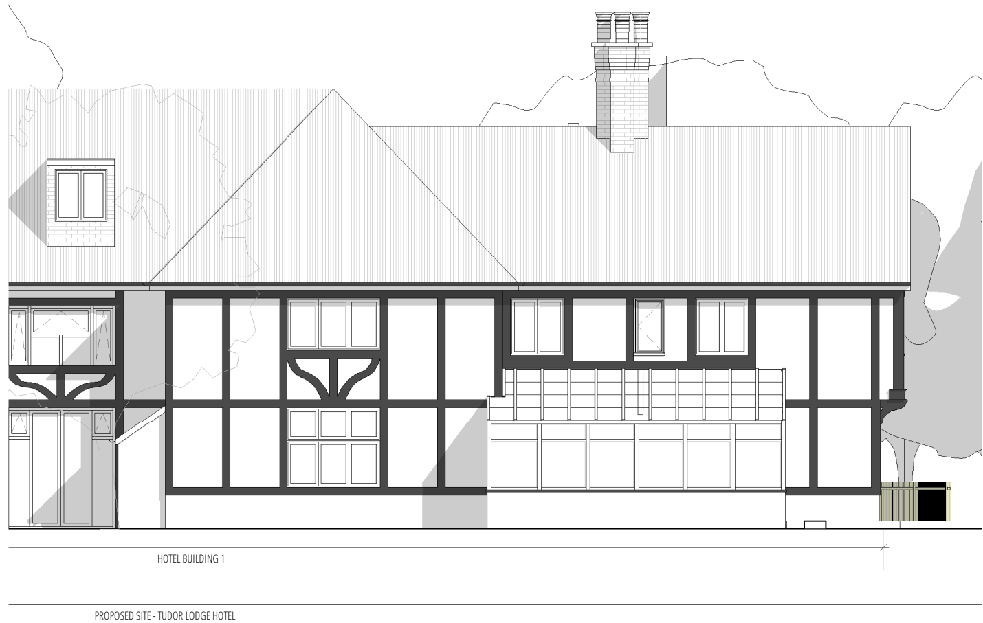
02 EXISTING FRONT S/W ELEVATION 1:100 @ A3