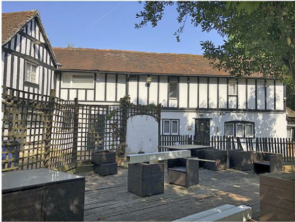
PHOTO 8 : VIEW OF HOTEL BUILDING 1 & RESTURANT ENTRANCE & OUTDOOR DINING AREA