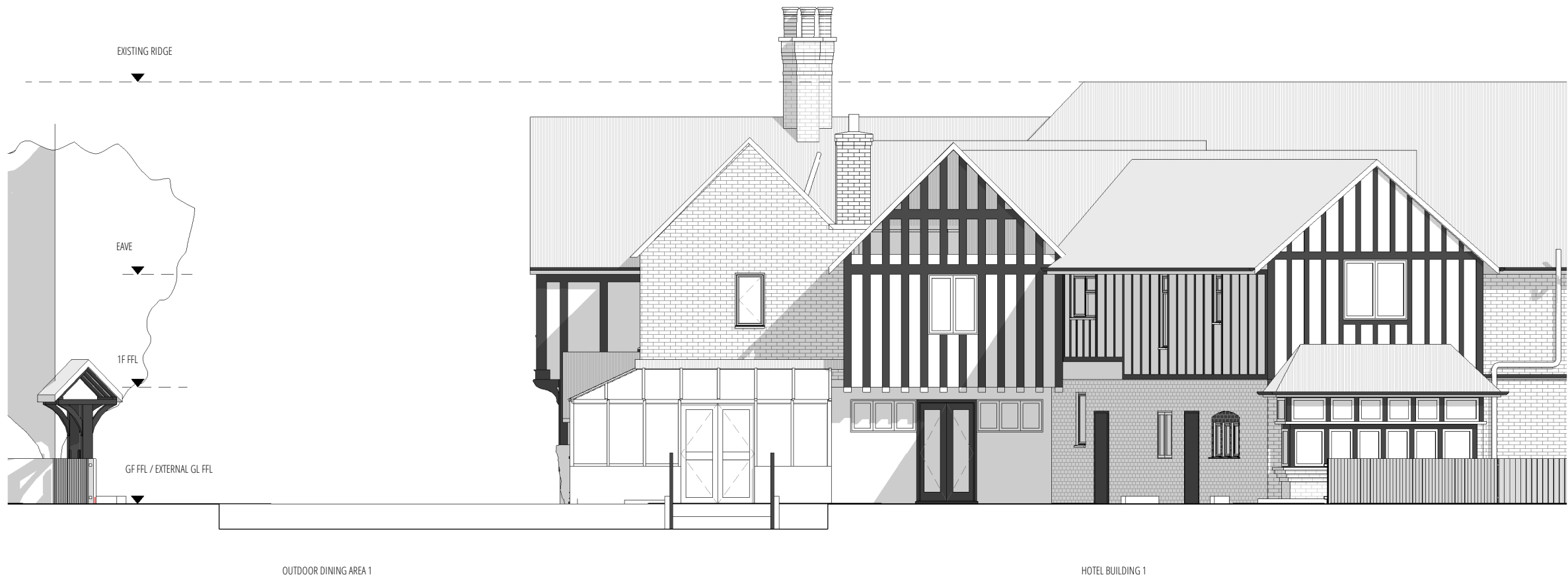
02 PROPOSED REAR / NORTH ELEVATION 1:100 @ A3