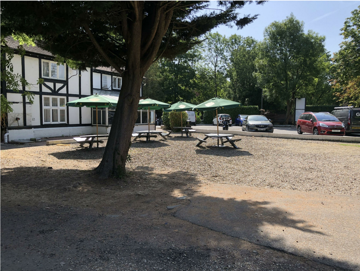
02 EXISTING PHOTO 2