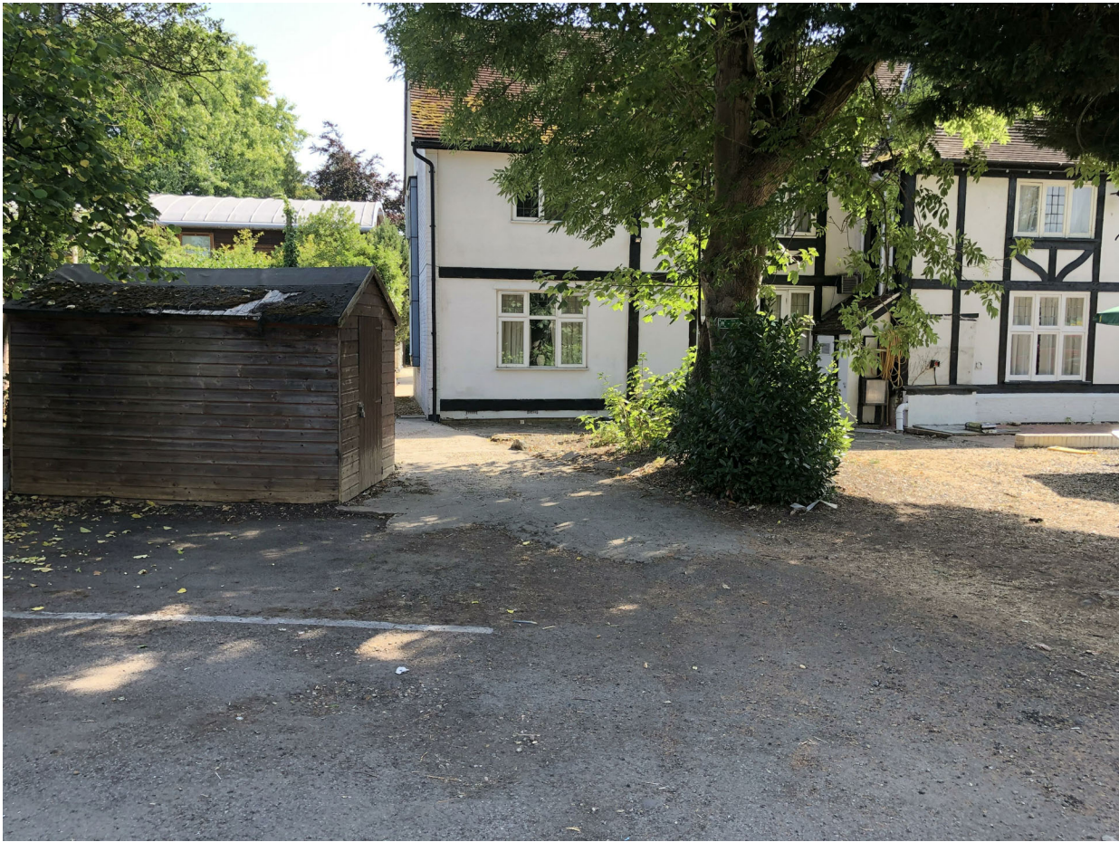
04 EXISTING PHOTO 4 1:500 @ A3

J79 STUDIO T: +44 (0)7742 071 052 W: info@j79studio.co.uk Unit 312 Wey House 15 Church Street Weybridge KT13 8NA