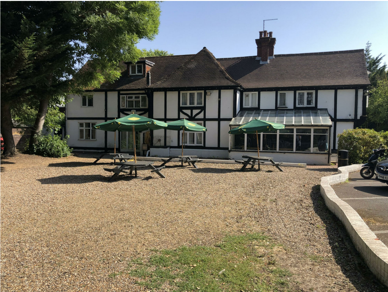
01 EXISTING PHOTO 1 1:500 @ A3