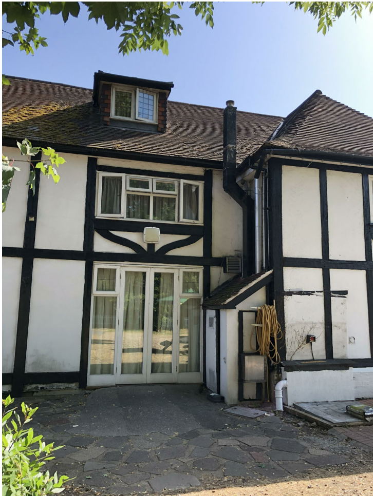
03 EXISTING PHOTO 3 - TUDOR SUITE 1:500 @ A3