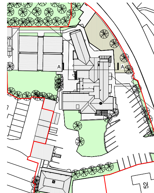
03 KEY PLAN 1:500 @ A3