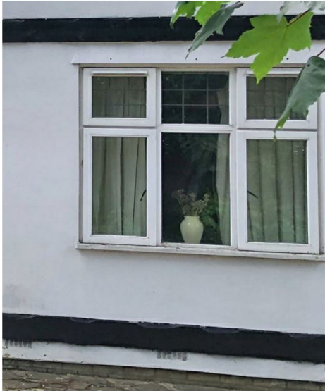
03 EXISTING WINDOW / EXTERNAL VIEW TUDOR LODGE HOTEL PLANNING COND APP 03