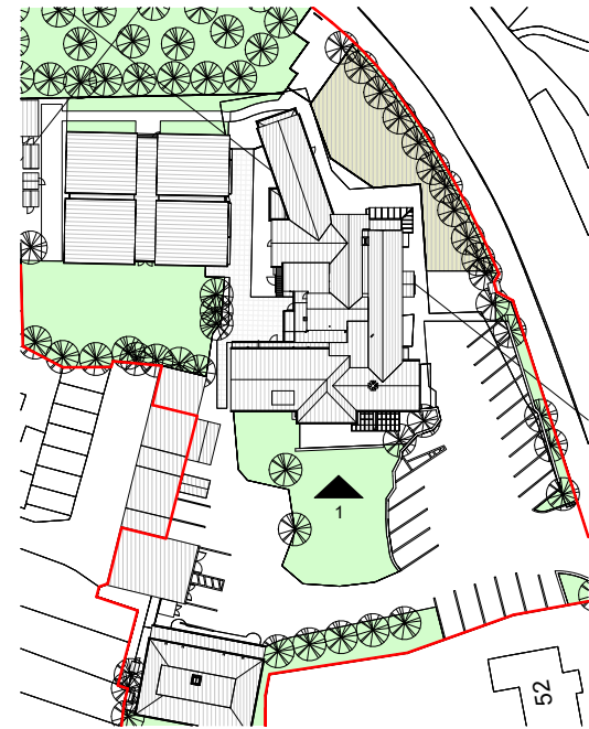
03 KEY PLAN 1:500 @ A3