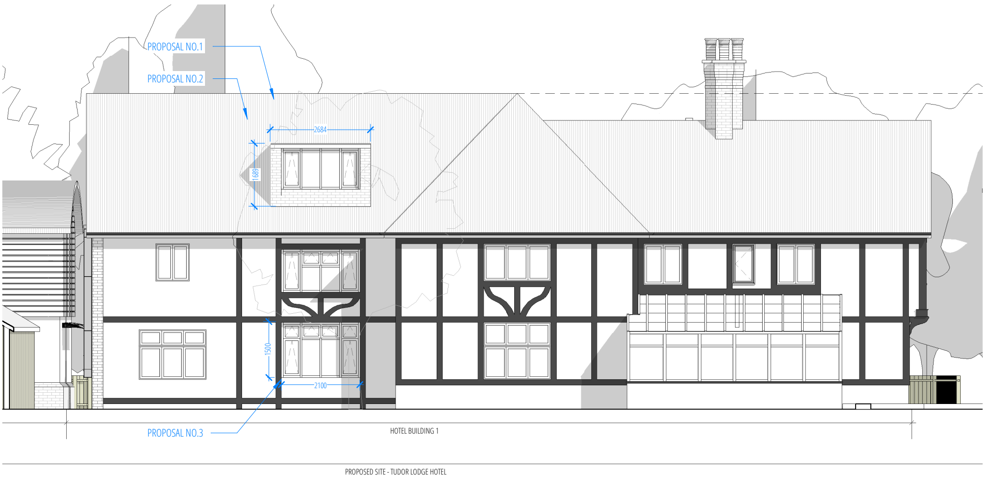
02 PROPOSED FRONT S/W ELEVATION 1:100 @ A3

PROPOSAL DESCRIPTION PROPOSAL NO.1 - REPLACEMENT OF ROOF TILE TO MATCH EXISTING PROPOSAL NO.2 - EXTENSION TO EXISTING DORMER PROPOSAL NO.3 - REPLACE EXISTING PATIO DOOR WITH WINDOW